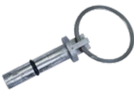
341GF Aircraft Adaptor Tool PN 207210-01G