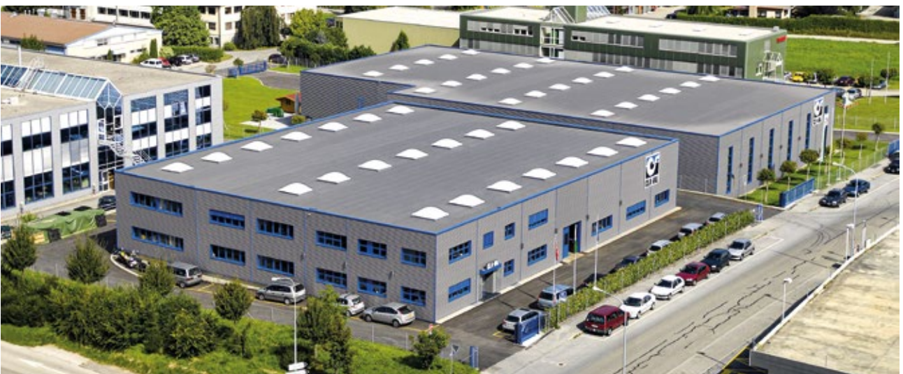
Lausanne, Switzerland - European Offices

With strategically located distribution centers and sales offices throughout the world, Cla-Val is the ideal source for superior technical know-how, unparalleled customer service and the finest quality products.