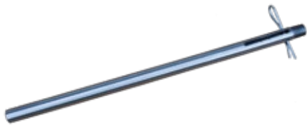
347GF Ball Collection Tool PN 300861-01