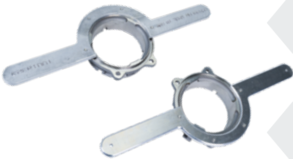
347GF Aircraft Adaptor Tool PN 206119-01A