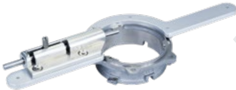
347GF Aircraft Adaptor Tool with Poppet Locking Pin PN 212325-01J