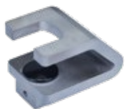
343GF / 348GF Block-Out Pin PN 203431-01J