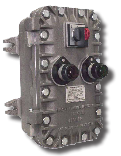
Liquip PD501 shown